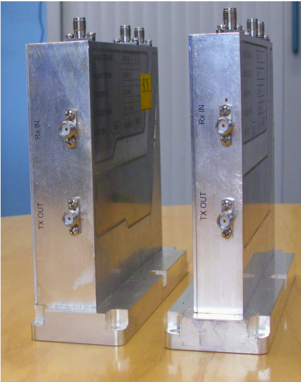
-01 Module on the left, -22 module on the right

When using the -22 variant modules, the +8V supply needs a capability of at least 2.2A for maximum output, hence it is convenient to use a 3A regulator (78T08 or similar). This regulator needs to have sufficient heatsinking. Typical current on receive is 0.38A, while on transmit current is around 1.8A, peaking to 2.2A.